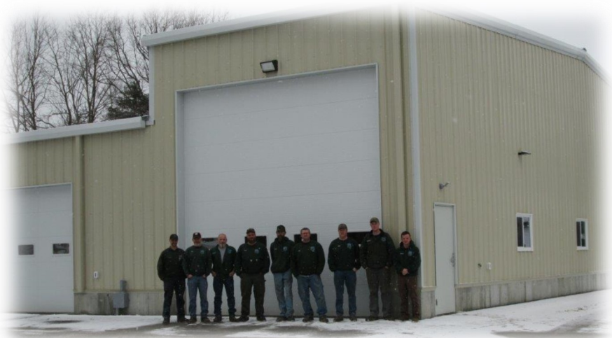
Highway Crew in Front of the New Highway Garage Addition