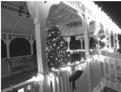
New lights in the Gazebo

Respectfully submitted, Ossipee Main Street