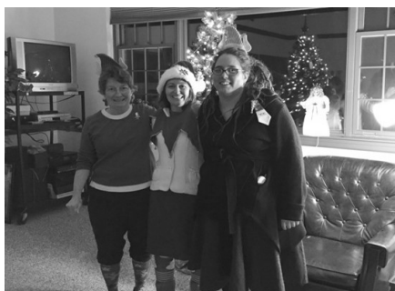
Holiday Story Time with Library Elves – December 19, 2016